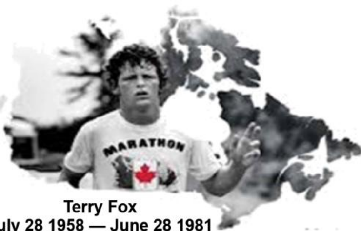
Terry Fox July 28 1958 — June 28 1981